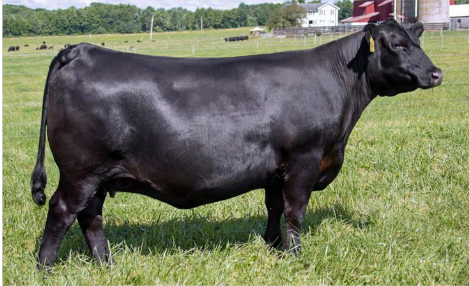
B&B Rita 0184 - Granddam of Lots 21 & 22