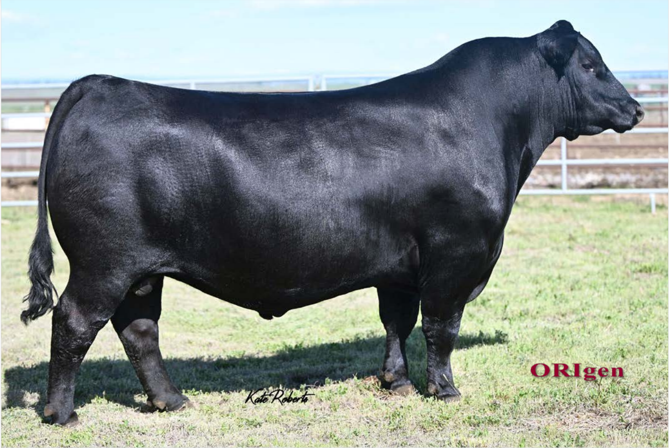
RSA True Balance 1311 - Semen Lots 29-31