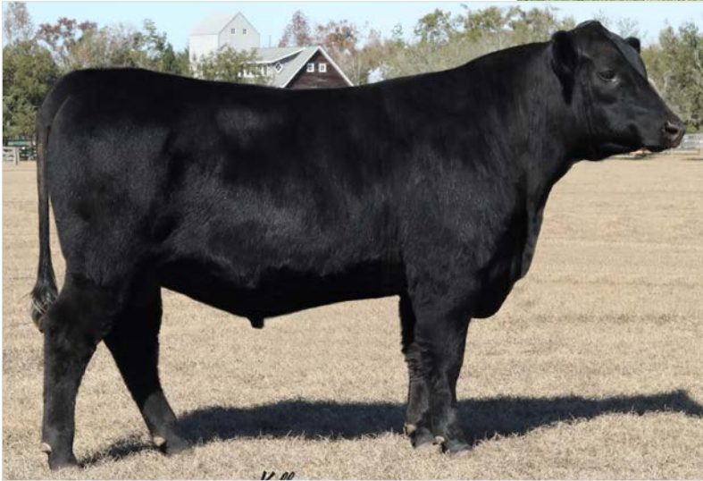
B I G Free Bird - Semen Lots 38-41