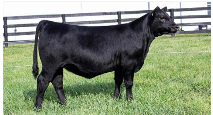
AH/B I G Majority 598 5557 - $50,000 Maternal Sib to Lots 8-10

A guarantee of 1 pregnancy if work is performed by a licensed professional. Embryos will ship from Genetic Visions in Newville, PA.