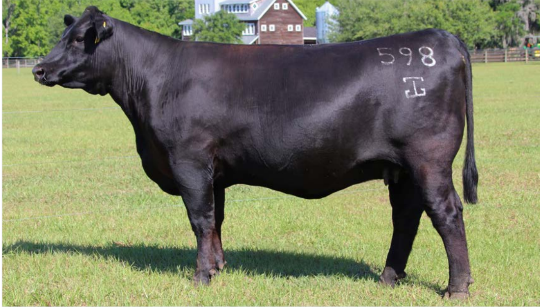
G A R Sure Fire 598 - Dam of Lot 8 Embryos