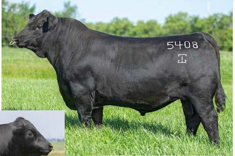
G A R Wallace - Semen Lots 26-28