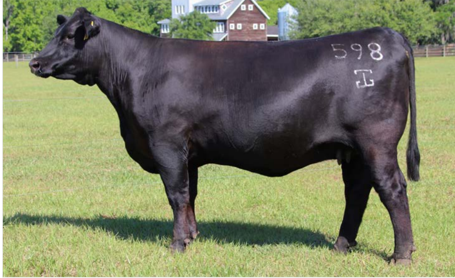
G A R Sure Fire 598 - Dam of Lot 19