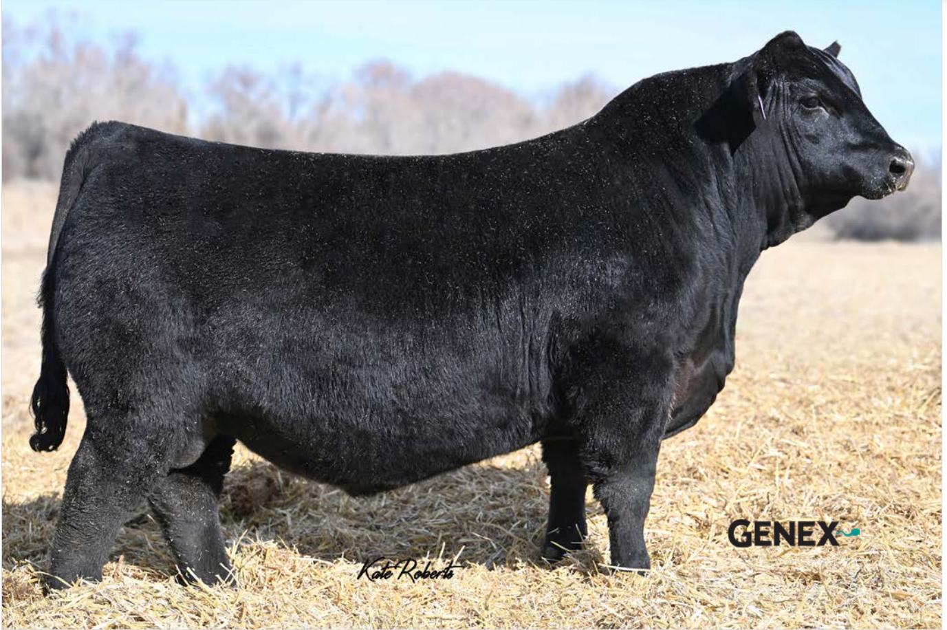
Ellingson Prosper - Semen Lots 42-45