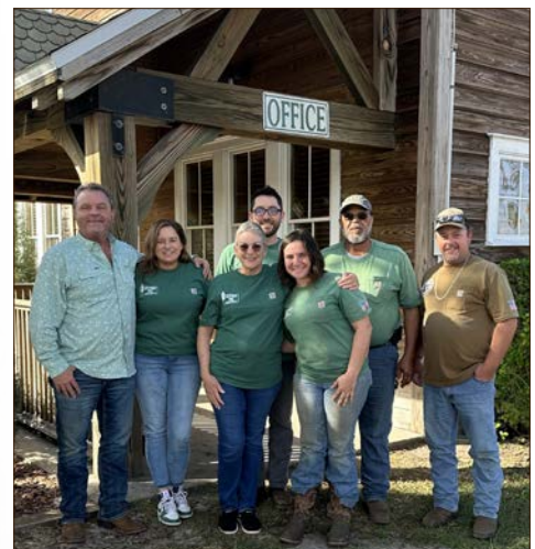
BIG TIMBER CREW