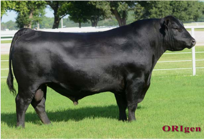
FF Rito Ambitious - Semen Lots 34-36