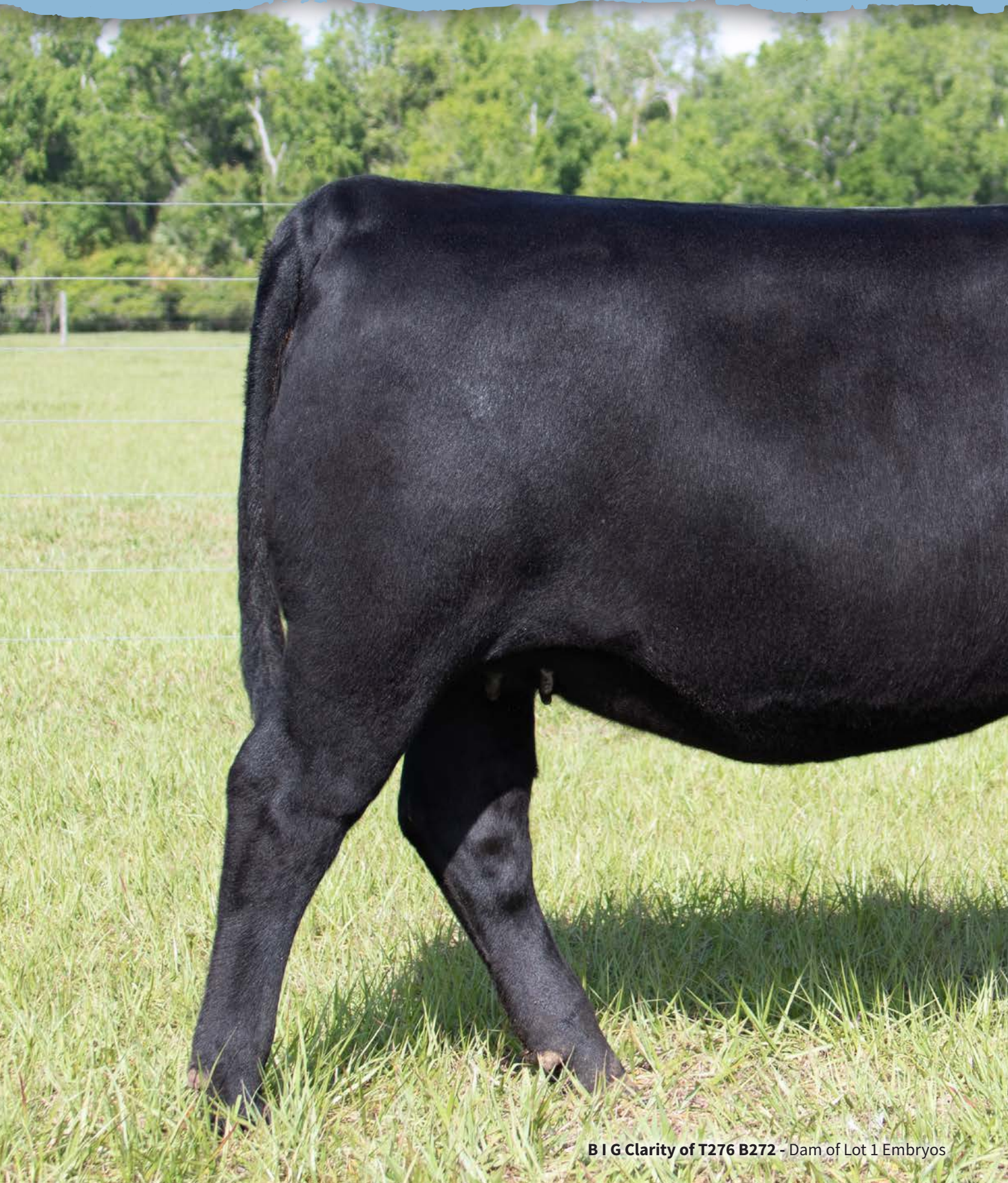
B I G Clarity of T276 B272 - Dam of Lot 1 Embryos