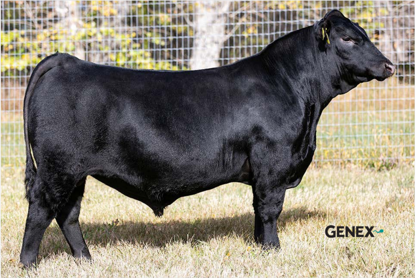
PEAK First Avenue - Semen Lots 46 & 47