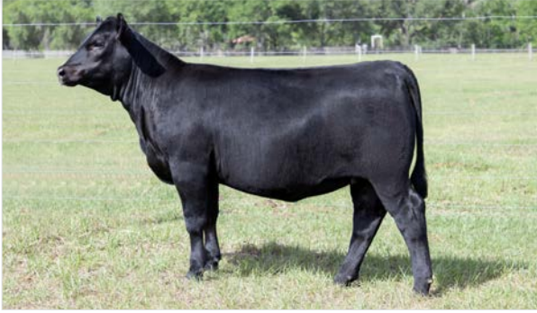
B I G Home Run of R91 - $47,500 Maternal Sister to Lots 2-6