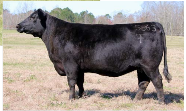
FF Rita 5B63 of 356H 3S10 - Granddam of Lot 12-14 Embryos