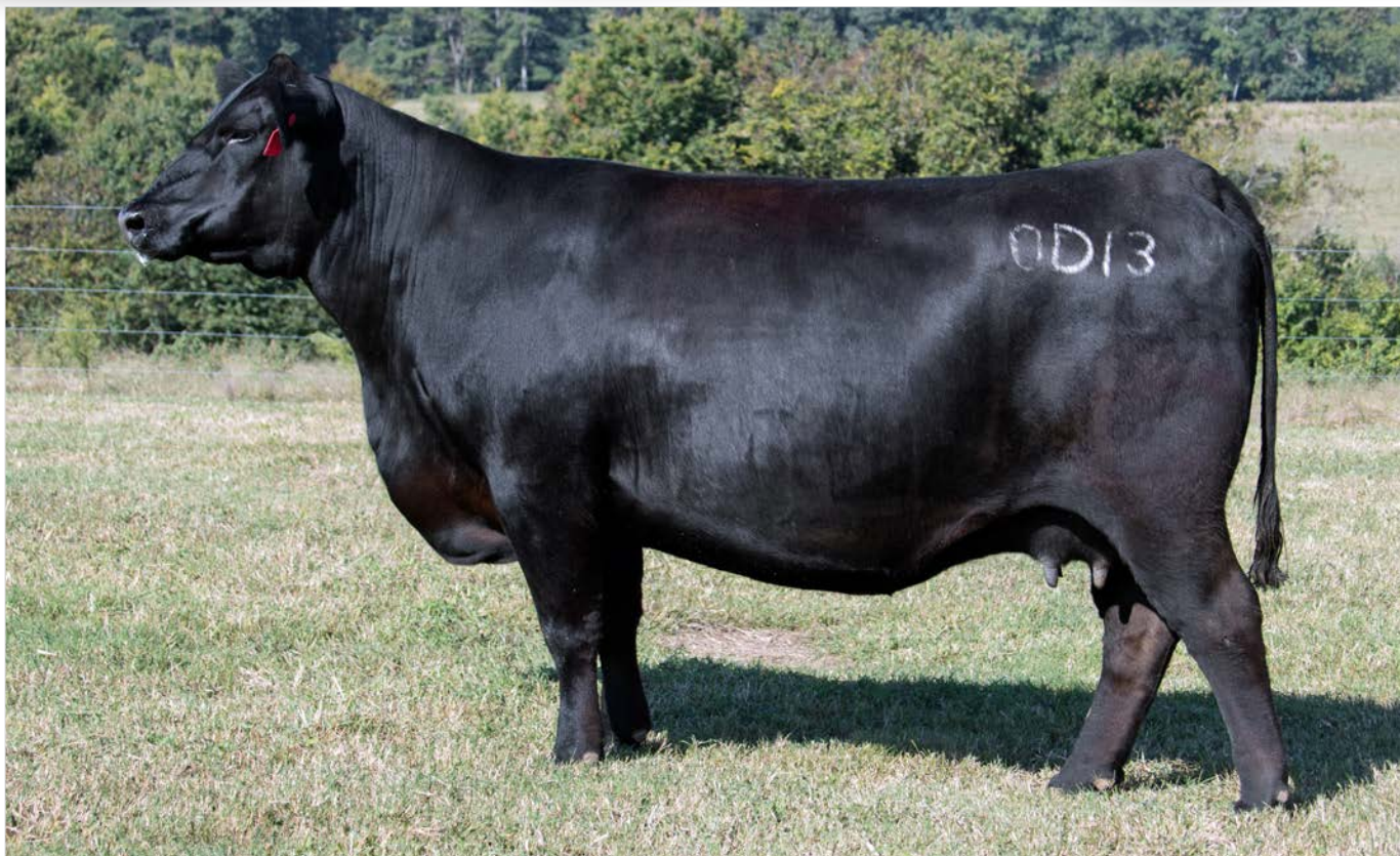
FF Rita 0D13 of 8M10 Radiant - Dam of Lots 15 & 16