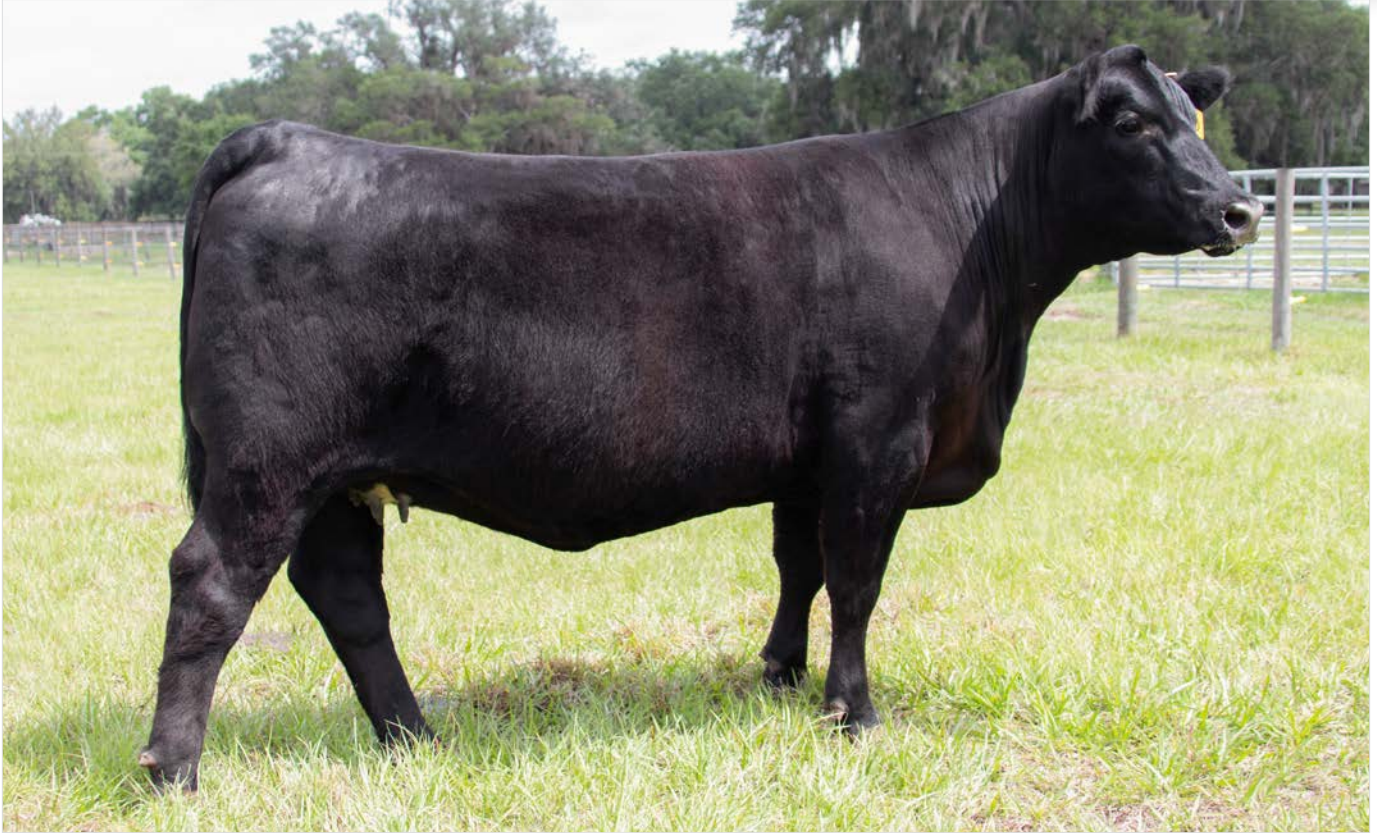
KF Ruby of Tiffany 2200 - Dam of Lot 17