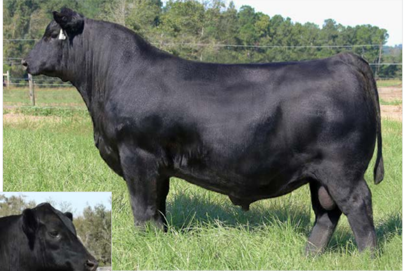
G A R Grid Maker L1071 - Semen Lot 37