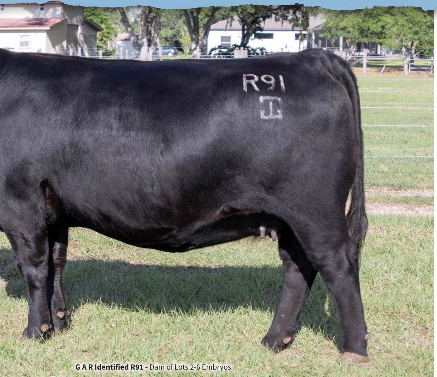
G A R Identified R91 - Dam of Lots 2-6 Embryos