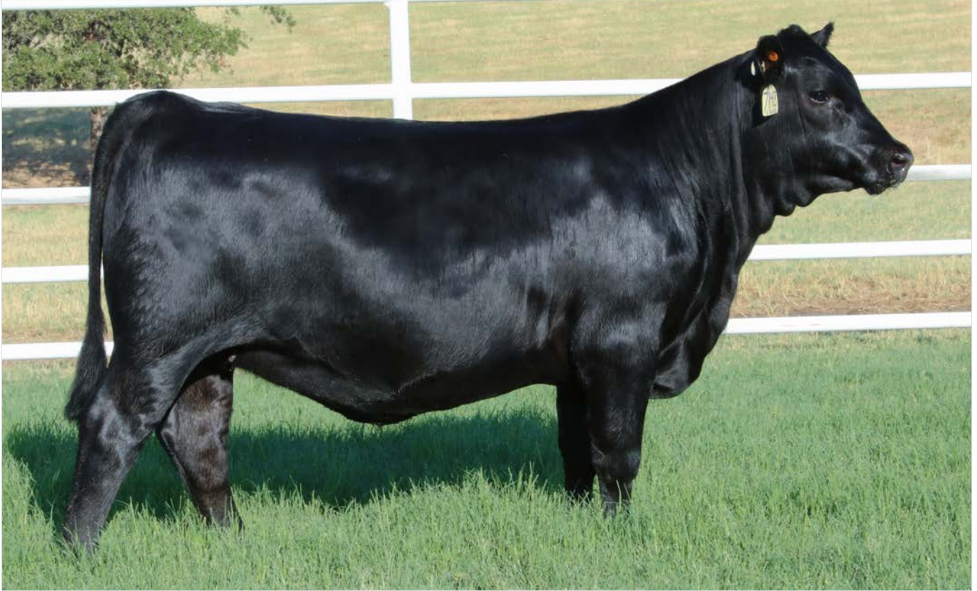
CoX Rita 3019 - Dam of Lot 11 Embryos