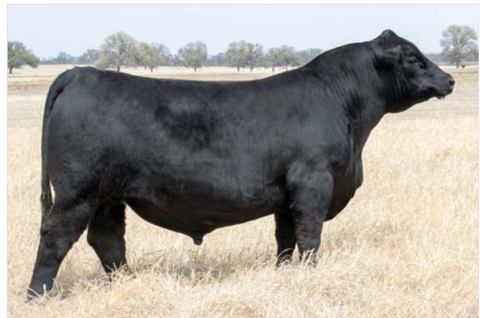
Wilks Crick 3708 - Sire of Lot 7 Embryos

Three IVF reverse sorted embryos by a female that needs no introduction, the $1 million producer, Green Garden Lady T276, who is still pumping out elite genomics and superb phenotype, coupled with one of the hottest bulls in the breed, Wilks Crick. Folks, check out the genetic combination on this pedigree. You get the legendary Lady 453, Rita 1034, and Lady T276 in the same pedigree. Combined earnings on these three matrons is over $13 million in progeny sales.