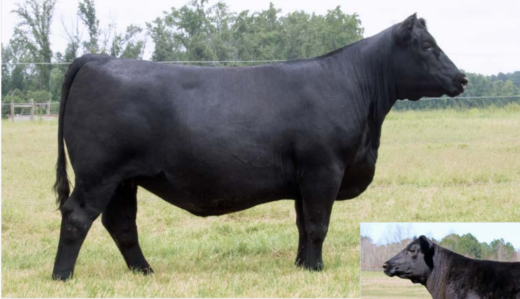
FF Rita 2T31 5B63 Alt - Dam of Lot 12 Embryos