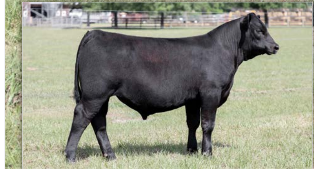
B I G MAGA - $220,000 Valued Maternal Brother to Lots 2-6

Take advantage of one of the last opportunities to get in on a cow family that has already produced over $500,000 in progeny sales that had an unfortunate accident and is no longer with us, the deceased, G A R Identified R91, that proved her ability to move the genomic dial into uncharted waters. She produced the $220,000 BIG Maga and the $47,500 selection of Grimmus Cattle in the May 2025 sale. These matings are cutting edge and have unlimited potential. Folks, you can't go wrong here. If you are looking for something to pop off the charts and have that killer eye appeal, look no further.