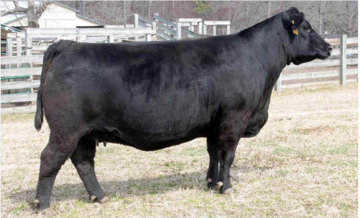
Green Garden Lady T276 - Dam of Lot 7 Embryos