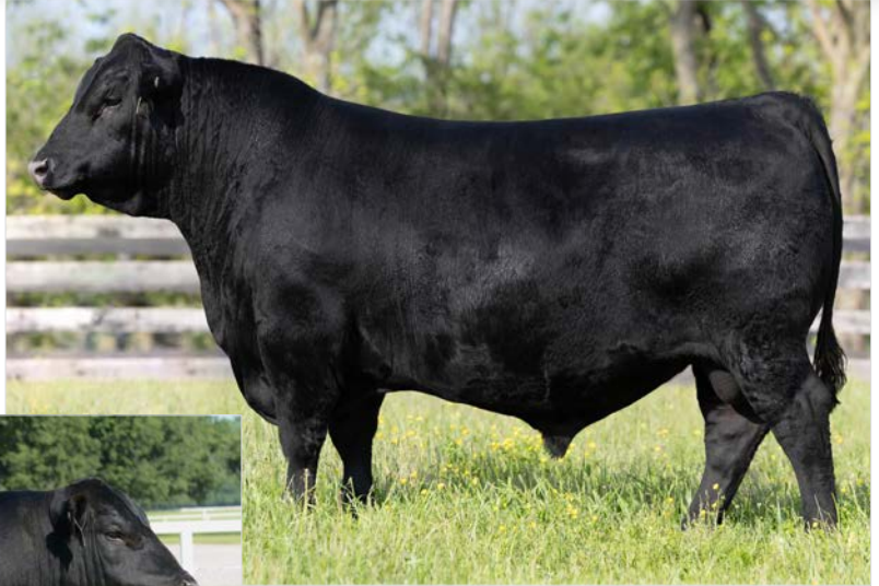
DBA Lincoln 3012 - Semen Lots 32-33