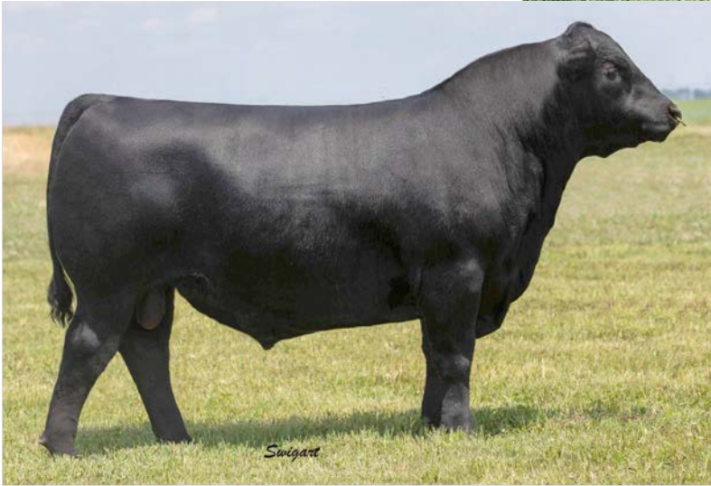
MG Magnitude - Lots 24 & 25 Semen